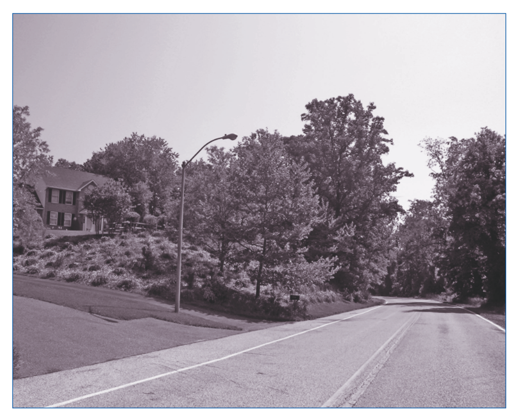
Scenic road in the Developing Tier.