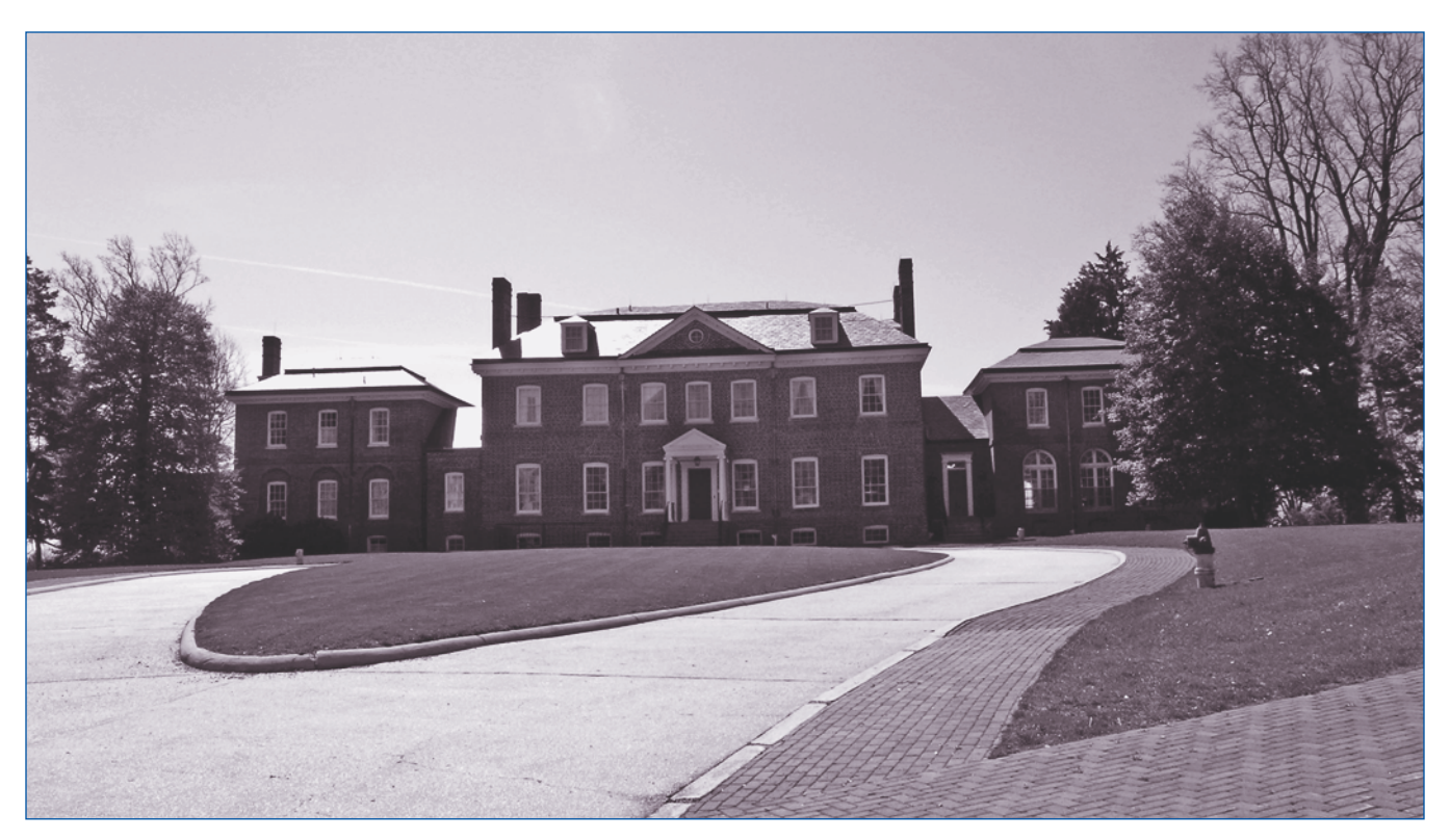
The main block of the Belair mansion was built in the 1740s for Samuel Ogle, provincial governor of Maryland, and was the country home of his son Benjamin Ogle, State Governor from 1798 to 1801. It is now the centerpiece of the residential community of Bowie.